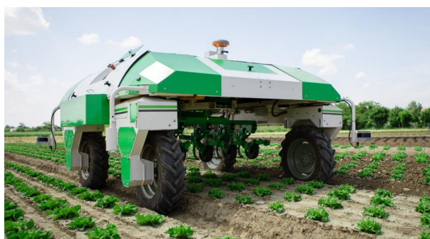
Figure 1. Dino weeding robot (autonomous).

What is already being used in practice, however, are camera- and GPS-controlled chopping modules that can be attached to and pulled by tractors. All relevant autonomous models for organic production are embedded with GPS and cameras, allowing the robot to move autonomously and precisely without human intervention. However, the robot's performance may strongly depend on natural parameters such as the presence of rocks.